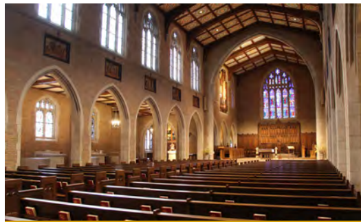
SACRED HEART MAJOR SEMINARY, DETROIT