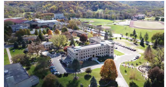
IMMACULATE HEART OF MARY SEMINARY WINONA, MINNESOTA

Founded in 1948. Located on the Saint Mary's University campus. Seminarians take classes with students enrolled at Saint Mary's and formation classes as seminarians. About 50 seminarians are enrolled each year. Seminarians earn a BA in philosophy.